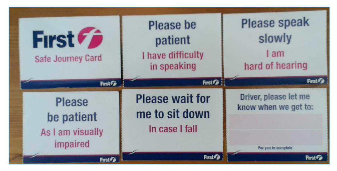
Figure 2 Safe journey card, fronts

FirstGroup have provided a selection of cards with different messages on them for people with different needs. To use them, the appropriate card to your needs should be selected and torn off from the rest and the spaces left for additional information filled in. Figure 2 shows the front of the cards and Figure 3 the backs.