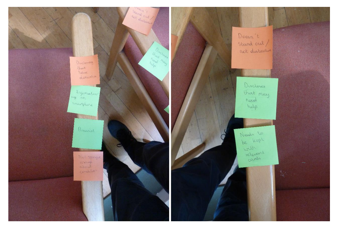
Figure 6. Good and bad features on post-it notes