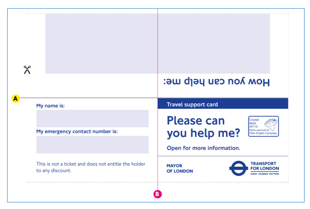
Figure 1.Transport for London, Travel support card

They also liked the minimal amount of information that the card had on it and the fact that it does not mention the word 'dementia'.